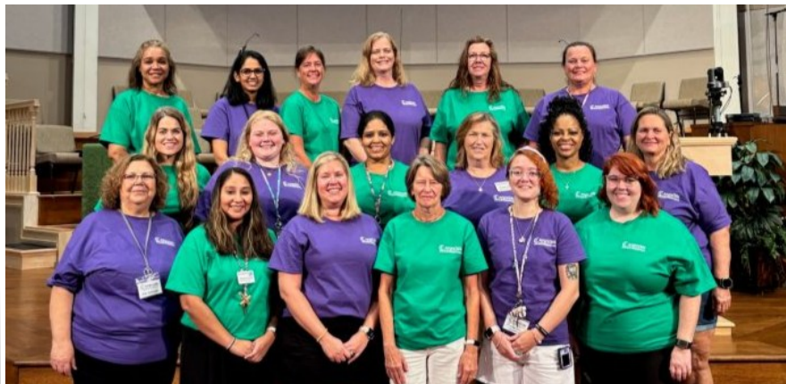
2025/26 Preschool Staff